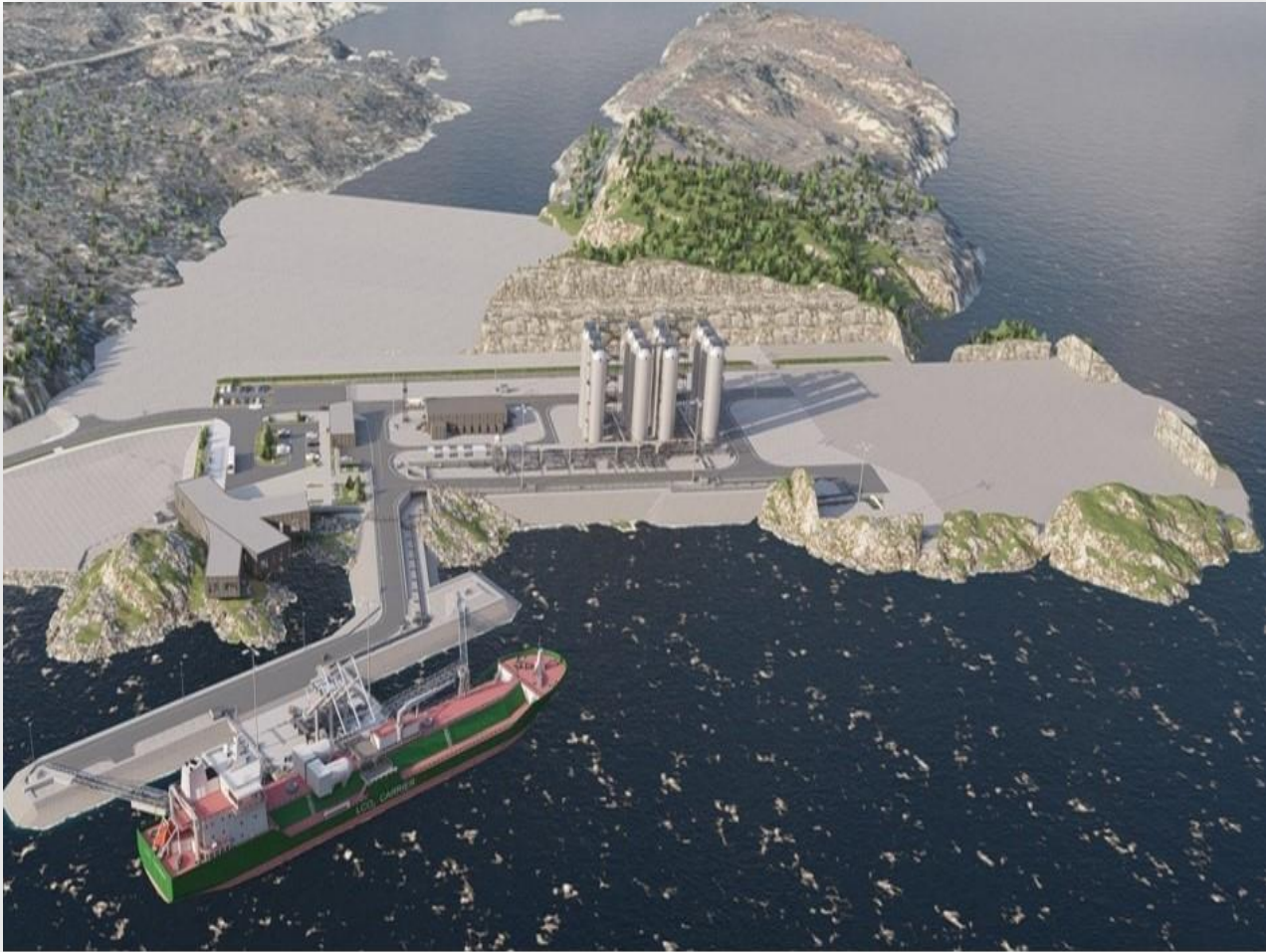
Northern Lights' CO 2 receiving terminal in Øygarden.