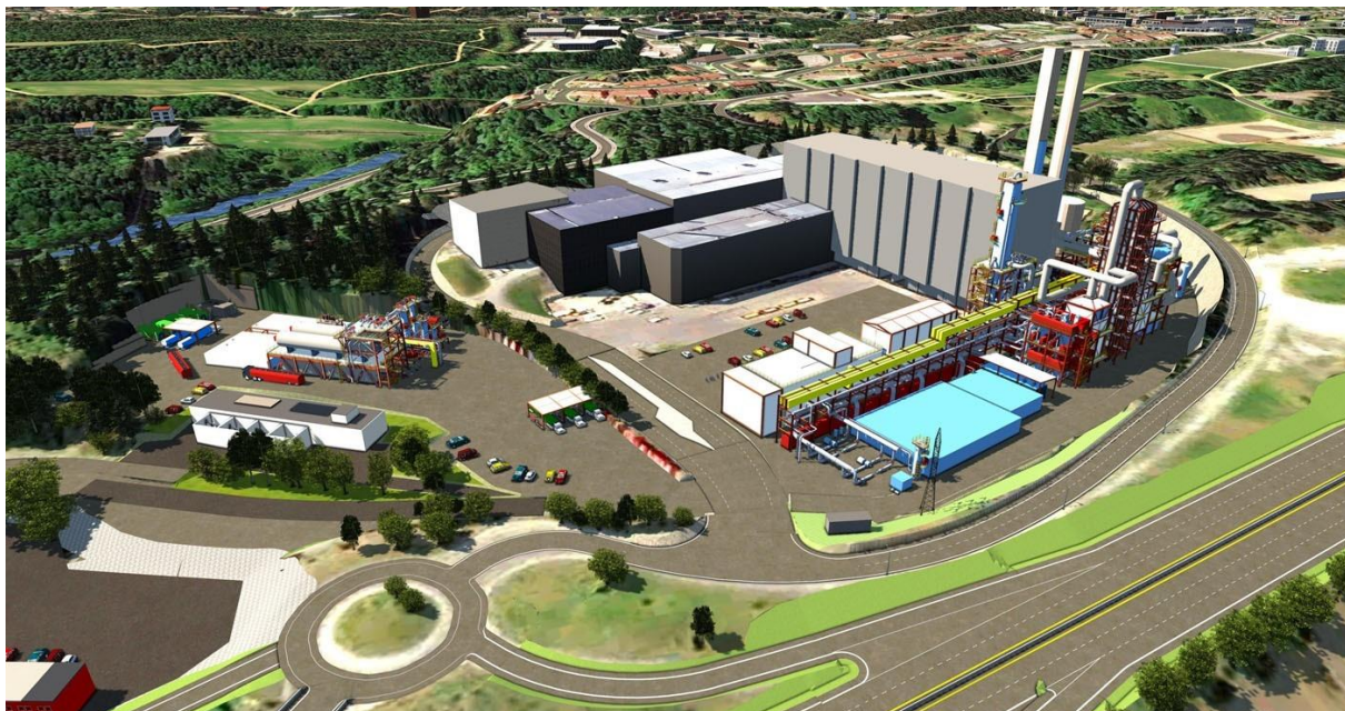
Hafslund Oslo Celsio's CO 2 capture plant will be capturing 400 000 tonnes of CO 2 from 2026.