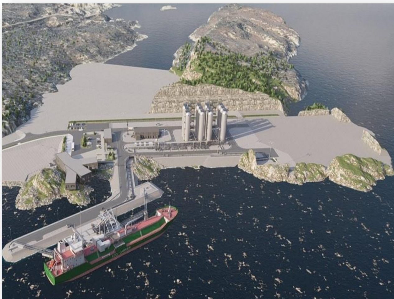
Northern Lights' CO 2 receiving terminal in Øygarden.

customers passed the selection in Innovation Fund's second round in July this year. Maturing commercial agreements between potential customers and Northern Lights is continuing. Northern Lights is also in dialogue with customers not relying on funding from the EU Innovation Fund.